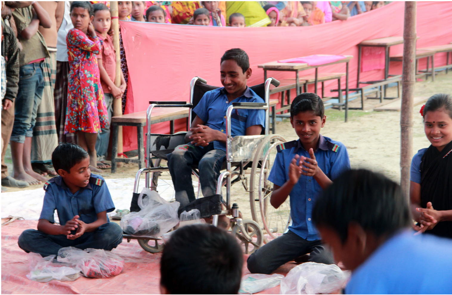
Children participate in a mock drill.

ENHANCE staff expertise. In addition to consultations with the World Bank’s Global Disability Advisor as appropriate, and ensuring that there is a corps of staff available for internal “just in time” consultation (including staff with disabilities), guidance notes and other training, information, and professional development tools should be made available to guide staff in ensuring that DRM-related projects incorporate disability from the earliest phases onwards.