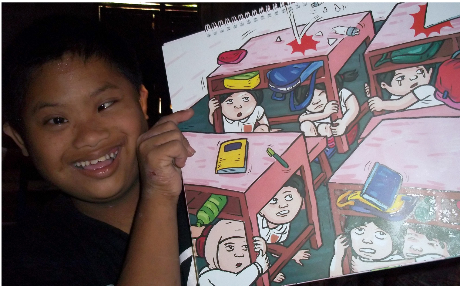
Indonesia: Building resilience for children with disabilities. Disaster Risk Reduction training has to include all members of society, especially the most vulnerable.

unable to find, count, assess, or communicate with persons with disabilities. If DRM personnel do not see any persons with disabilities, it can lead to the assumption that “there are no persons with disabilities,” or that “all persons with disabilities must have died,” excluding persons with disabilities from DRM activities, including relief and recovery efforts.