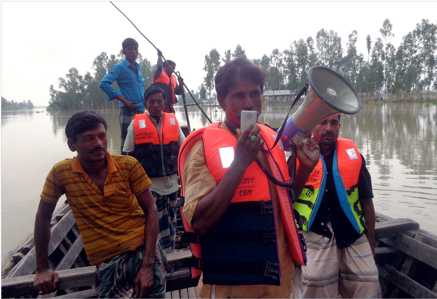
Evacuation in process in Bangladesh.

certainly not with persons with disabilities. Though in some cases specific attention is given to households with disabled persons, such interventions are rare. Moreover, such an approach only addresses accessibility of the house and not the wider societal context in which the person lives. Although an admirable start, such restrictive approaches fall short of achieving the vision of “building back better.”