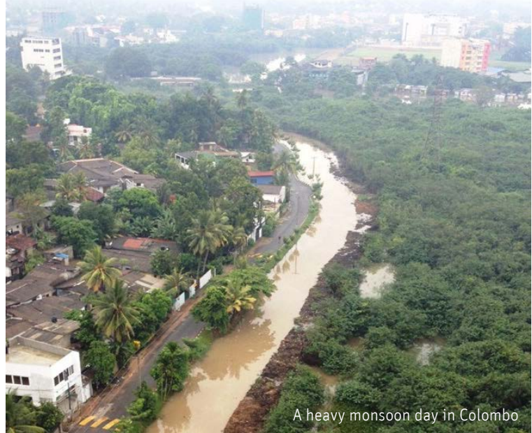
A heavy monsoon day in Colombo

In the Colombo Megapolis Development Plan, which is currently being finalized, Colombo's urban wetlands have been strategically mapped as green areas, preserving the wetlands' natural character and co-benefits to the city. This will limit encroaching development. Legal protection for the wetland complex as a 'conservation zone' has been proposed via a draft cabinet paper and is currently being reviewed and processed.