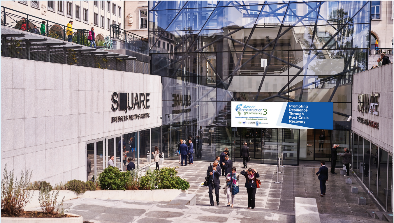
Entrance to the World Reconstruction Conference 3 venue.

The Third Edition of the World Reconstruction Conference (WRC3) was hosted by the European Union (EU) and jointly organized and financed by the European Commission's (EC) Directorate General (DG) for International Cooperation and Development (DG DEVCO), the DG for European Civil Protection and Humanitarian Aid Operations (DG ECHO), the World Bank's Global Facility for Disaster Reduction and Recovery (GFDRR), the United Nations Development Programme (UNDP) and the African, Caribbean and Pacific Group of States (ACP). The Conference was also co-financed by the ACP-EU Natural Disaster Risk Reduction Program, managed by GFDRR.